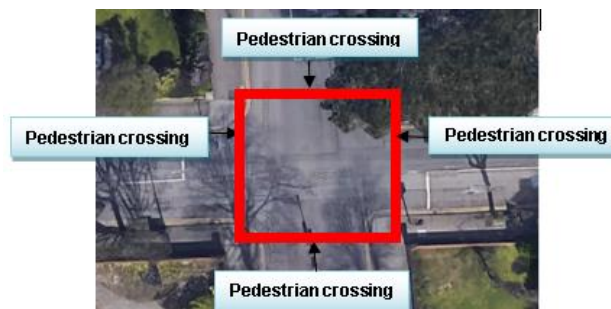
Figure 3: Cowper Road/Palmerstone Road – 4 Pedestrians crossings

The junction of Cowper Road/Palmerstone Road requires the installation of the 4 pedestrian crossing for the 4 arms of the junction.