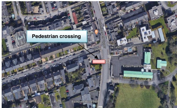
Figure 4: Pedestrian Crossing at the outside of Kildare Place School/ Rathmines Road Upper

Installation of pedestrian crossing at the outside of Kildare Place School/ Rathmines Road Upper.