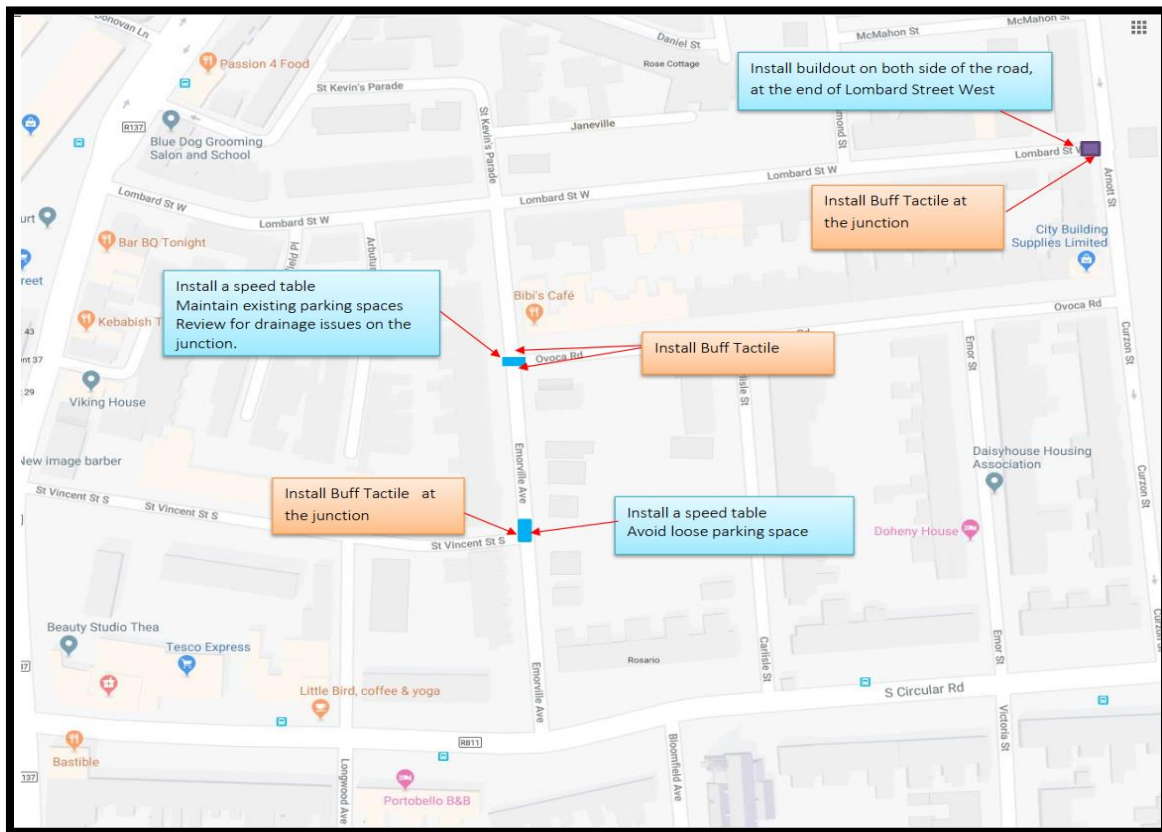
Figure 2: Build-out and Speed Table at Lombard Street West and Emorville Avenue.

This project is in the process of detail design, the Traffic Advisory Group seek to maintain the exiting parking arrangement in the area. After the detail design is produced and If resources becomes available, this project will be carried out for the construction stage (between the ends of 2019-2020).